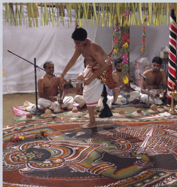
Kalamezhuthu Pattu ritual

A visual and auditory performance where intricate floor art meets hypnotic music, leading to possession states.